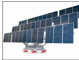
Photovoltaic solar plant