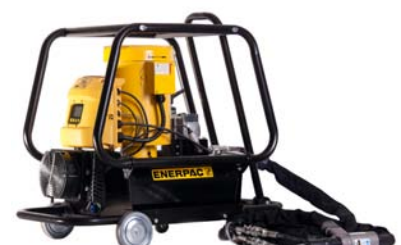
734 AV™ series